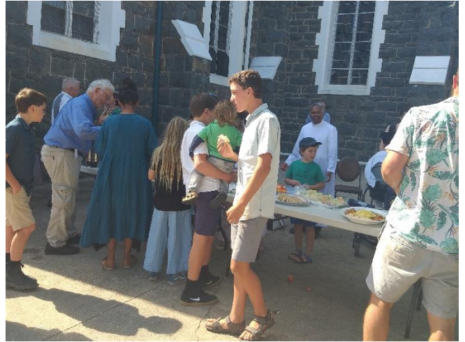
Morning Tea is held on the 1^{st} Sunday of the month after 10 a.m. Mass

Enjoying great company and yummy food at Pie in the Sky Bakery, held on 1<sup>st</sup> Friday of each month at 10.30 a.m. – Come along and join in. Note: For April only it will be held on the 2<sup>nd</sup> Friday because of Good Friday.